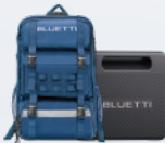
Handsfree 1 Backpack Power Station