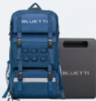
Handsfree 2 Backpack Power Station