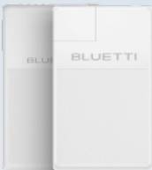
FridgePower & BlueCell 200