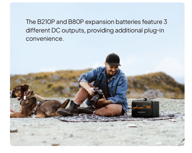
3 Outlets Make All the Difference