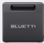
Handsfree 1 Portable Power Station