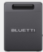
Handsfree 2 Portable Power Station